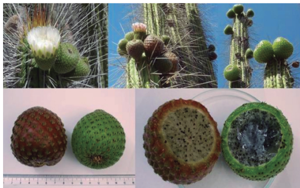
Figure 2. Rumpu fruits, pink and green peel; view of pulp with seeds.