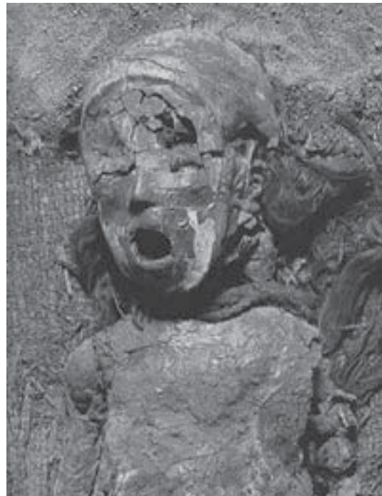
Figure 3. Chinchorro child, red style. Niño Chinchorro momificado estilo rojo.