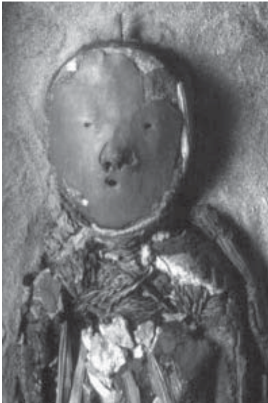
Figure 2. Chinchorro child, black style. Niño Chinchorro momificado estilo negro.

Chinchorro's captivating mortuary tradition transformed the corpses into human effigies. From the Camarones Valley, this mortuary custom spread north and south, covering about 900 km along the Atacama Desert and the Pacific coast. Corpses were defleshed and were reassembled using sticks, clay, and mineral pigments added to human skin and bones. Facial and sexual organs were modeled and subsequently the complete body was carefully painted with manganese. The final product was a rigid and shiny black body, the so-called black mummies (Arriaza 1995; Arriaza and Standen 2002). As the centuries went by mummification was applied to individuals of all ages, including human fetuses, and the techniques changed dramatically. The complete body except the face and wig was painted with a bright red ochre pigment that was sometimes burnished. Facial characteristics were modeled, emphasizing open eyes and mouth, as if the body was conveying life, and breathing. These red mummies first appeared around 2000 B.C. and continued for almost 500 years (Figures 2-4).