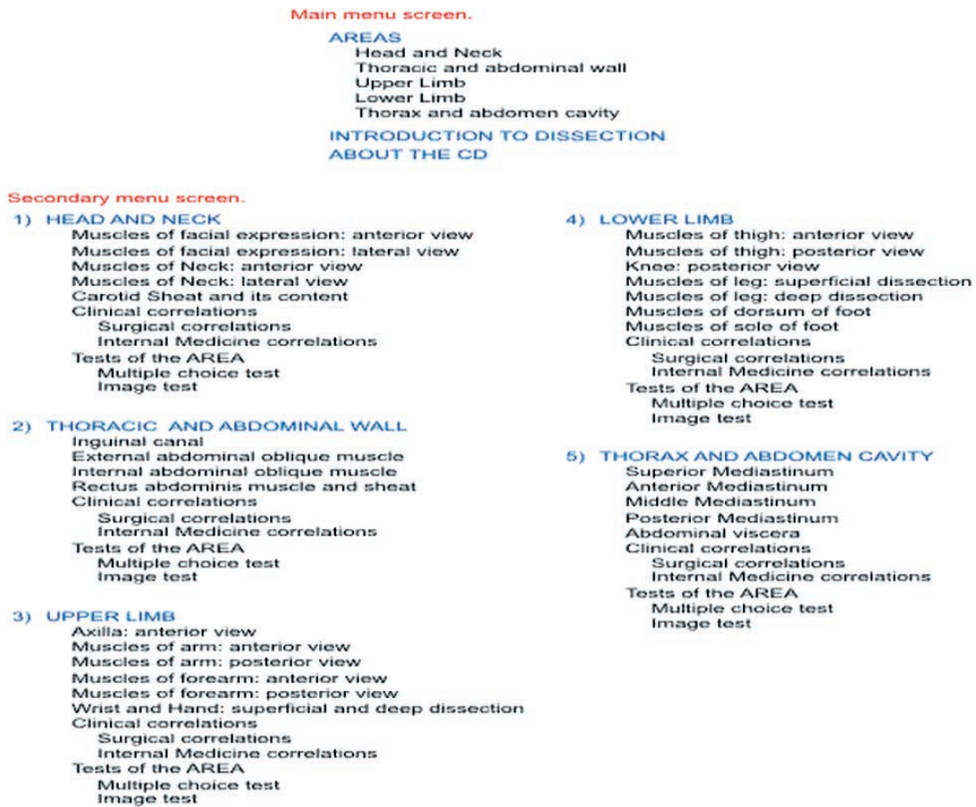
Fig. 1. Show the map with the contents of the developed program.

the most important anatomic relations and the characteristics for their recognition during the lab dissection. The descriptions were made by the members of a teamwork using different anatomy books as reference (Lockhart, 1965; Van de Graaff, 2000; Moore, 2003).