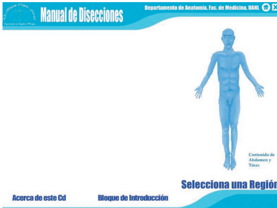
Fig. 2. Show the main menu screen of the program. You can choose an area to study.

At present, we are making a study to determine the effect that is produced in the development of the students in the anatomy lab. We hope that our project placates the development of a higher quantity of applications that integrate the use of the computer to the lab practice as a tool that solves problems and not as a substitute of the traditional techniques.