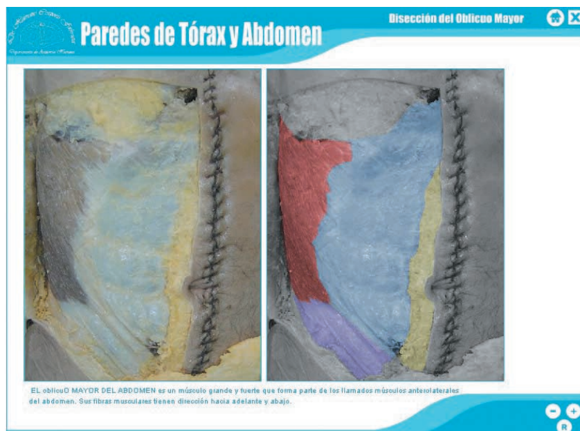
Fig. 4. Show the study screen. By passing the mouse on each structure on the photograph a short description related will appear just under the images.