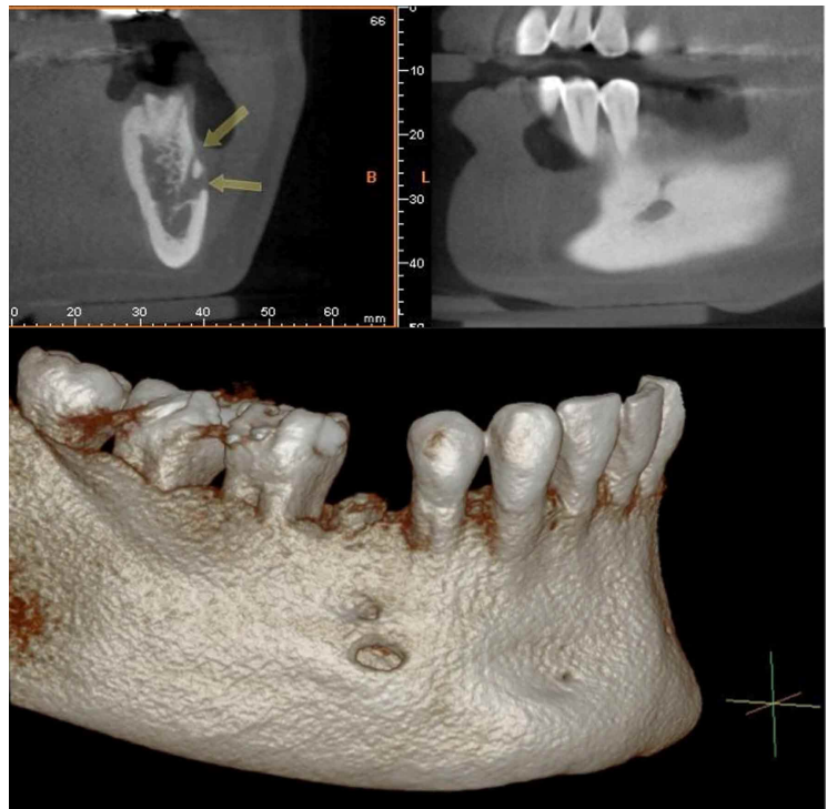
Fig. 1. The accessory mental foramen and canal on the female patient's right side are seen in the CBCT coronal cross-section. Images show the mental foramen and accessory mental foramen (arrows). An inferior image shows the Three-dimensional with the location of the accessory mental foramen.

The mean diameter measured on CBCT for the AMFs was 1.23 ( \pm 0.45 ) mm, and mean diameter of MF was 3.4 ( \pm 0.7 ) mm. The mean ratio between their diameters (AMF diameter/MF diameter) was 0.4. The mean vertical distance