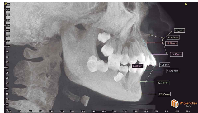
Fig. 1. Image of the analysis performed on facial class II subjects. The eversion produced in the lower lip can be explained by compression from the upper incisor; the records generated in the image can also be seen (Simplant O&O).

The bone soft tissues in the mandibular region revealed similar measurements between the class II and class III groups. In the analysis of the A point, minor variations were also found. The result of the measurements of the lower cervical point reveals average differences close to 5 mm between the two groups. The naso-labial angle, by contrast, was increased in the class II subjects ( 113.42^\circ ), while in class III subjects this angle was smaller ( 107.24^\circ ), showing a difference of 6.18^\circ between the measurements. All the results are shown in Table I.