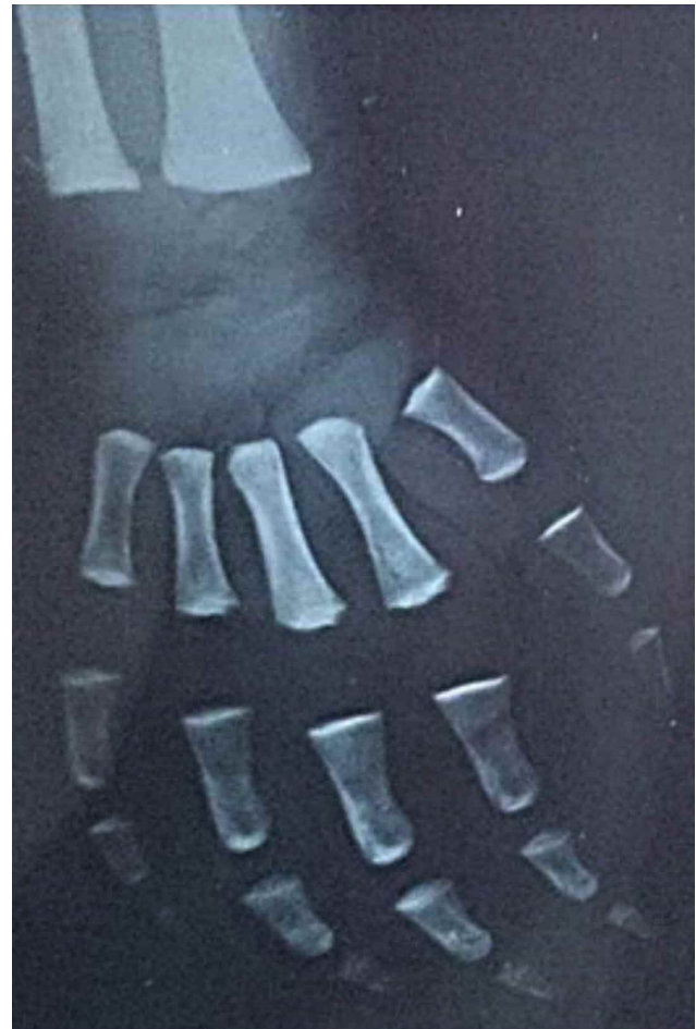
Fig. 1. The hand radiography taken from 26 week old female fetus.

The general external measurements of the fetuses were performed in the first place. It was determined in the measurements performed that there was no difference between sexes ( p > 0.05 ). Afterwards, the mammographies