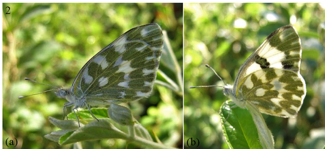
Figure 2. (a) and (b). Photographic records of Pontia daplidice moorei in Shangbangla village, Meghalaya, India.

The adult male is white on the upperside having black apex with white spots and lines on the forewing; presence of a broad-black patch at end-cell; underside hindwing with green blotches. Female similar to male, but with a discal spot on upper forewing and two obscure rows of marginal spots on upper hindwing.